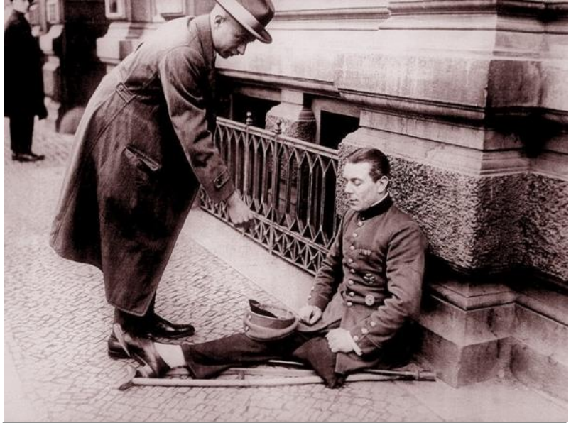
A wounded German veteran asking for money on the street in 1919. Many veterans came back to destroyed homes and were thus rendered homeless.

that once the war was won, Germany would be able to pay off the debt by annexing resource-rich industrial territory from its enemies. The Kaiser also believed that he would be able to impose massive reparation costs on the defeated nations. This strategy, however, failed when Germany lost the war. Immediately, the new Weimar Republic was left with a broken economy, a discouraged society, and a monumental amount of national debt, and due to the Treaty of Versailles, further reparations to pay to the victors of the war. As of now in 1920, around 50 German Mark is equal to one United States dollar, and this exchange rate is projected to worsen in the near future. The committee must come up with actionable policies to combat the inflation and to repay the debt and reparations in some manner.