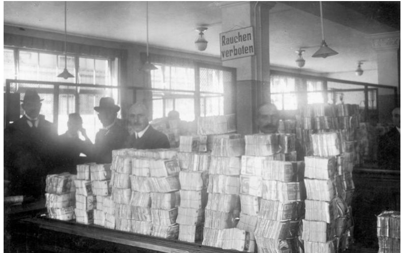
Piles of German Mark awaiting distribution at the Central Bank in Berlin during the hyperinflation.

Furthermore, such economic issues have given rise to an increase in unrest among the populace of the nation. With businesses, shopkeepers and artisans worried about the future success of the industry, many bright and talented individuals of Germany seek to leave for more prosperous lands, particularly the United States. Among those who cannot afford to leave, extreme poverty and hunger is on the rise, creating further socio-economic issues for the nation. Additionally, the resulting increase in homelessness and poverty, coupled with the many veterans and nationalists that want revenge for the humiliation of the German Empire by the Treaty of Versailles, many in Germany are beginning to strike and protest.