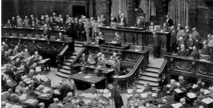
The Weimar Reichstag in session in 1920. With the members sitting in a semicircle arrangement in front of the Chancellor.

In concert with this spike in hostilities, trade is suffering which only serves to further the economic problems of the republic. With the expulsion from the League of Nations, and inflamed tensions between Germany and the rest of the international community, Germany had few trade partners to whom to sell its coal and machinery. It should be the aim of the parties supporting the democratic institution to remedy the situation, while it should be the general aim of the committee to alleviate the damages of these circumstances.